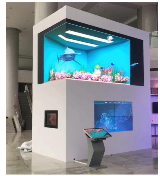
90 degree do naked eye 3D effect